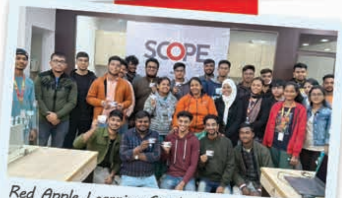
Red Apple Learning Students