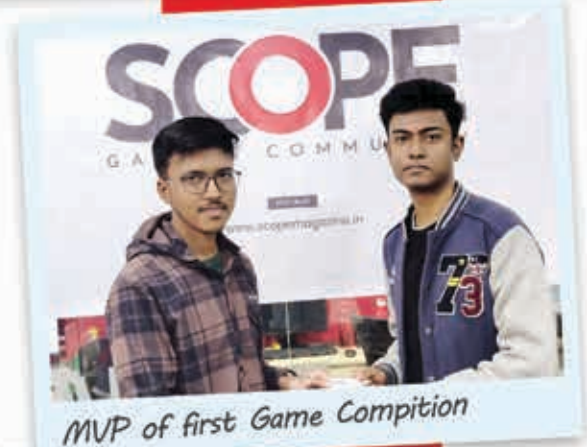
MVP of first Game Competition