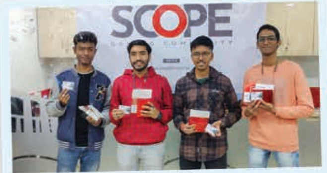
Winners of Game Competition