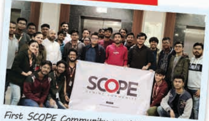
First SCOPE Community meet-up

Red Apple's remarkable journey at IGDC'23 is a testament to the company's commitment to innovation, excellence, and the development of the gaming industry. With its captivating booth and dedication to shaping the youth through its learning wing, Red Apple has showcased not only its prowess but also its vision for a future where gaming continues to evolve and inspire. As the Indian gaming industry grows at an unprecedented pace, Red Apple stands as a symbol of what's possible, leading the way with creativity, technology, and a commitment to making gaming accessible to all. The legacy of Red Apple in the world of gaming is secure, and the future holds even greater promise.